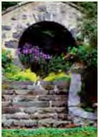
LEITH HALL Part of Scotland's Castle Trail Huntly AB54 4NQ

Non-NTS: Balmoral Castle; Cairngorms National Park; Royal Lochnagar Distillery (DS)