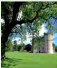
CASTLE FRASER Part of Scotland's Castle Trail Inverurie AB51 7LD

Non-NTS: GlenDronach Distillery; Huntly Castle (HS)