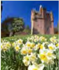
CRAIGIEVAR CASTLE Part of Scotland's Castle Trail Alford AB33 8JF