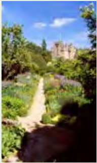
CRATHES CASTLE Part of Scotland's Castle Trail Banchorry AB31 5QJ